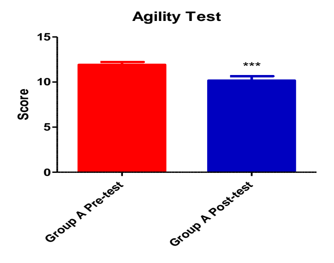
Graph 1 : Presentation of the Agility T test score Values in the improvement of agility in subjects within Group A