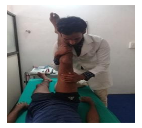
Figure 1: Subject Receiving Muscle Energy Technique

relaxation phase, the therapist passively took the leg into further flexion with 30 s hold. Then the subject's leg is lowered on the treatment table for a short resting period with duration of approximately 10s. The procedure is repeated again with the frequency of 2 reps.