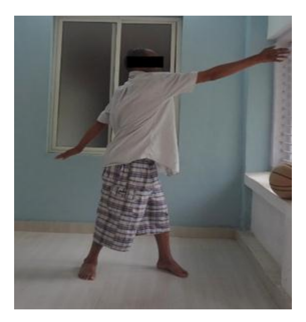
Figure 3: Sideways Big Rock and Reach