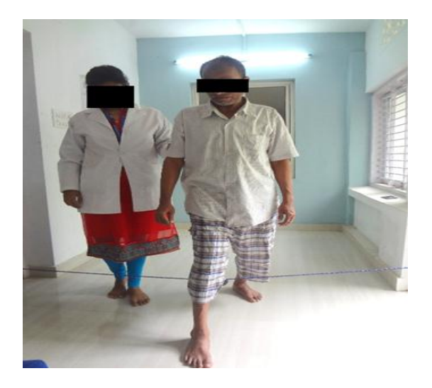
Figure 1: Patient performing conventional balance training.

During each treatment session, the patient was challenged with these 10 exercises: 4 from the first group of exercises, 4 from the second group, and 2 from the third group. Each single exercise was repeated several times (from 10 to 15 times, according to the patient's clinical condition) in 10 minutes. The patients received treatment sessions of 1 hour each day, 4 days a week for 4 consecutive weeks. Each exercise was individualized to the patient's balance ability. The therapist gave verbal instructions and, when required, assisted the patient in maintaining balance by providing support at the pelvis or chest.