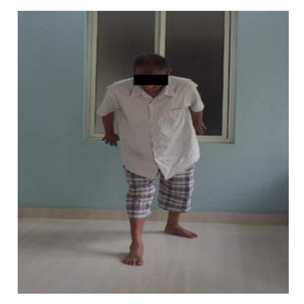
Figure 2: Backward Big Step